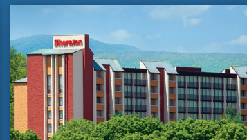
Sheraton Roanoke Hotel & Conference Center 540-563-9300 | SheratonRoanoke.com

REGISTER ONLINE TO WIN A BLUE RIDGE MOUNTAINS GETAWAY