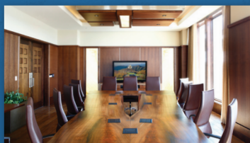
Primland 866-960-7746 | Primland.com