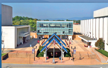
Berglund Center 540-853-6860 | TheBerglundCenter.com

Virginia's Blue Ridge is a scenic mountain destination that offers thoroughly exceptional facilities including two civic centers, an IACC-approved conference center and 680,000 sq. feet of meeting space.