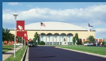
Salem Civic Center 540-375-3004 | SalemCivicCenter.com