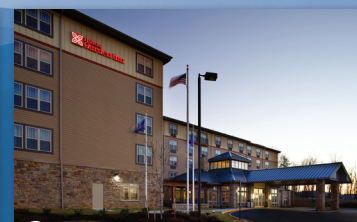
Hilton Garden Inn Roanoke 540-776-3400 | Roanoke.HGI.com