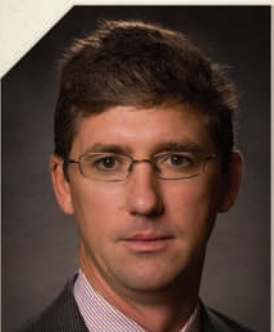
William W. Tunner